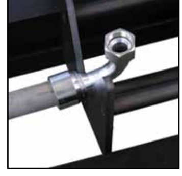
The elbow fitting adapter adds to the versatility of the KFP-10.

With the KFP-10 Fitting Pusher's low profile, swivel Casters and 110 Volt requirement it can be quickly and easily moved to the job. The simple strap hold down system makes it easy to quickly and accurately position the hose.