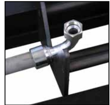
The elbow fitting adapter adds to the versatility of the KFP-10.

With the KFP-10 Fitting Pusher's low profile, swivel Casters and 110 Volt requirement it can be quickly and easily moved to the job. The simple strap hold down system makes it easy to quickly and accurately position the hose.