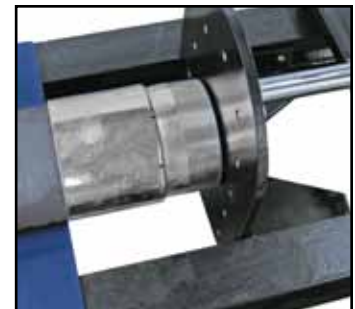
This fitting took 7 seconds to install.

“Traditional” methods of installing large fittings can result in damaged fittings, and at the very least is a time consuming procedure.