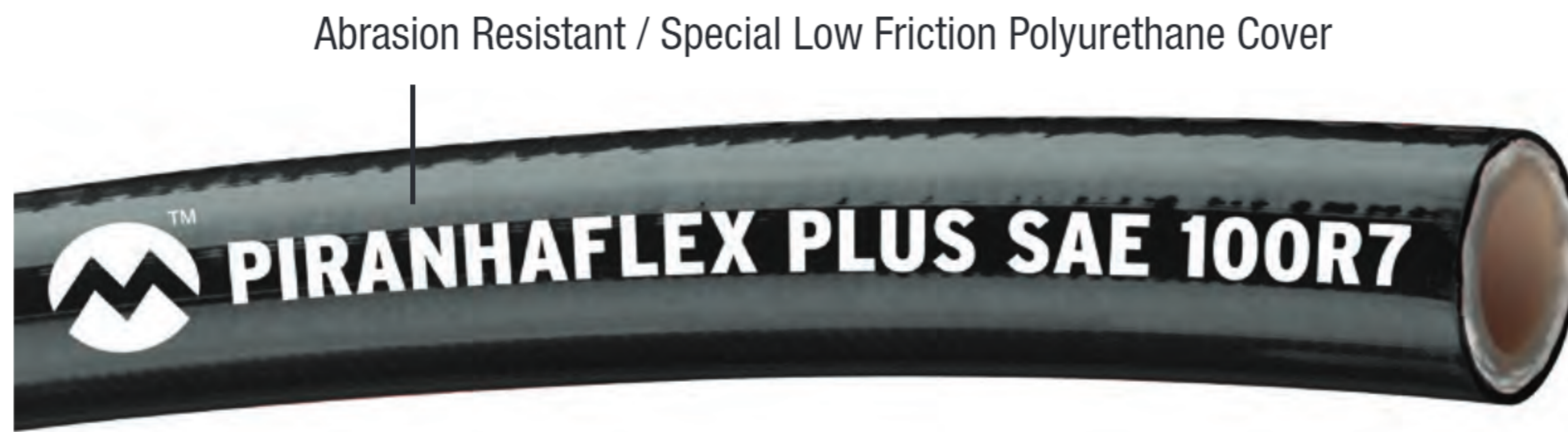
Braided High Tensile Strength Fiber Reinforcement