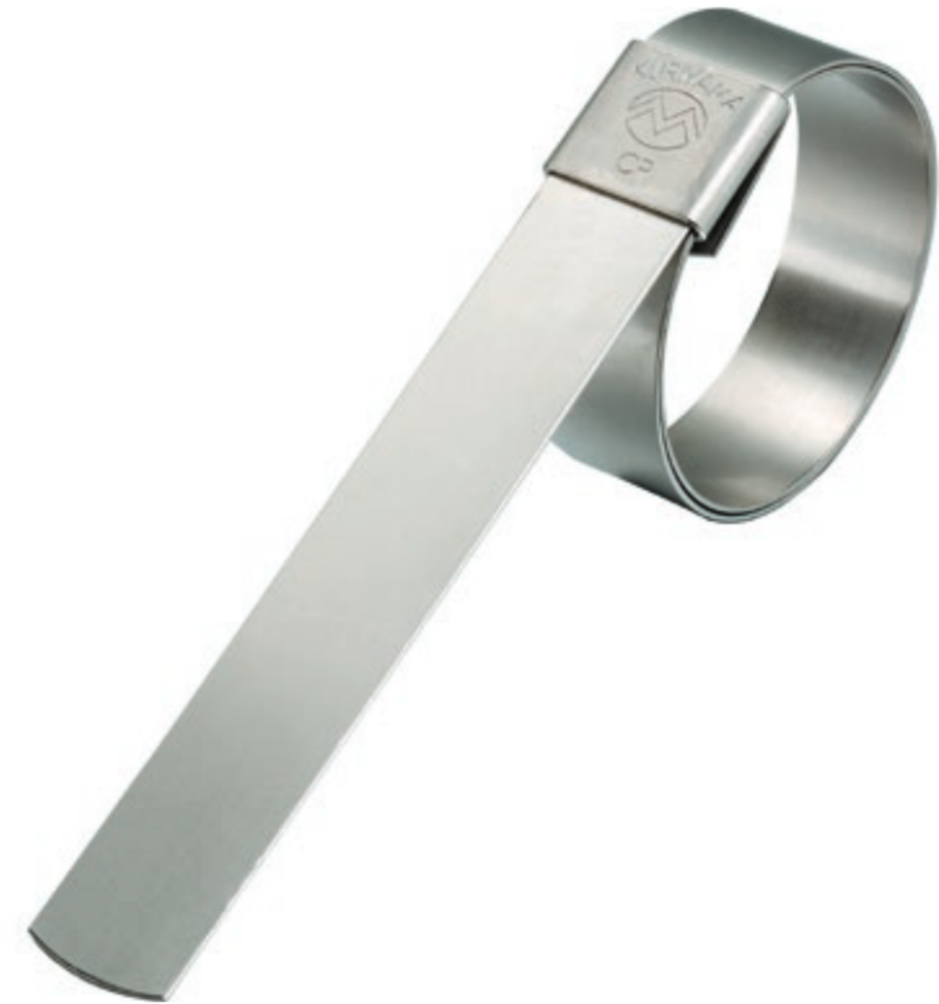
Galvanized Carbon Steel Center Punch Clamp